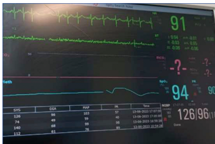
[Table/Fig-3]: Routine intraoperative vitals monitoring.

The patient was stable, and the procedure was initiated [Table/Fig-3]. The procedure was uneventful, and haemostasis was achieved. There was healthy wound recovery. The patient was haemodynamically stable, with non invasive blood pressure, heart rate, and oxygen saturation within normal limits, and was discharged on the 7 th postoperative day.