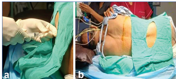
[Table/Fig-2]: The technique used to administer spinal technique and left lateral position given to the patient.

Additionally, the drug is more likely to be distributed evenly across the lower spinal segments, helping to achieve the correct level of anaesthesia, especially in the lower abdomen or legs. This position also provides easy access to the lumbar spine for the procedure and helps the patient remain comfortable and relaxed, reducing the risk of complications such as Post-dural Puncture Headache (PDPH) or nerve injury. A volume of 2.4 mL of 0.5% heavy Bupivacaine was administered, and a T10 level of anaesthesia was achieved [Table/Fig-2a,b].